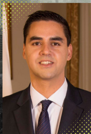
HON. IAN BORG